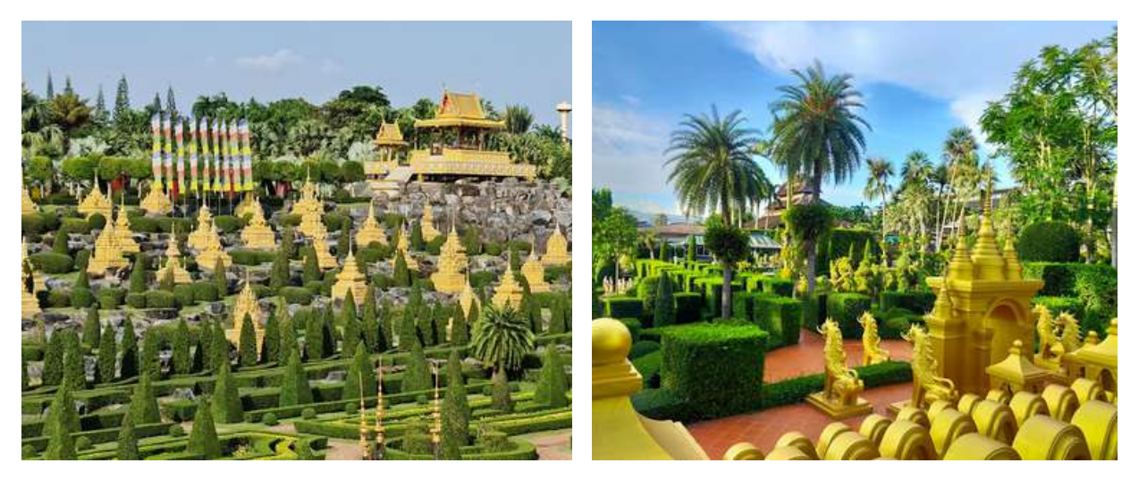
Nong Nooch Botanical Garden

IN THE GARDENS YOU WILL FIND AN ENORMOUS NUMBER OF PLANT AND FLOWER SPECIES IN A PARTICULARLY WELL KEPT ENVIRONMENT. THEMED GARDENS SEVERAL SECTIONS OF NONG NOOCH ARE SET IN A SPECIFIC THEME. STONEHENGE GARDEN STONEHENGE GARDEN IS MODELED AFTER A FAMOUS PREHISTORIC MONUMENT IN ENGLAND NAMED STONEHENGE, A RING OF LARGE STANDING STONES BELIEVED TO HAVE BEEN ERECTED SOME 5,000 YEARS AGO. BUTTERFLY HILL ON THE GENTLE SLOPE OF THE BUTTERFLY HILL YOU WILL FIND BEDS OF SEVERAL SPECIES OF COLORFUL FLOWERS PLANTED IN A WAY TO RESEMBLE THE SHAPE OF A BUTTERFLY. FRENCH GARDEN THE ALMOST FOUR ACRES LARGE FRENCH GARDEN WAS INSPIRED BY THE GARDENS OF THE 17TH CENTURY PALACE OF VERSAILLES. ANIMAL SCULPTURE GARDEN IN THE ANIMAL SCULPTURE GARDEN YOU WILL FIND SCULPTURES OF ANIMALS AS CAMELS, KANGAROOS, LAMAS, LEOPARDS AND DEER. OTHER THEMED GARDENS A FEW OF THE MANY OTHER GARDENS ARE BONSAI GARDEN, DESERT ROSE GARDEN, ITALIAN GARDEN, ORCHID GARDEN, CYCAD VALLEY AND BROMELIAD DISPLAY GARDEN. CACTUSES AND FAT PLANTS A COLLECTION OF CACTUSES AND FAT PLANTS (SUCCULENTS) THAT ARE USUALLY FOUND IN MUCH DRYER CONDITIONS SUCH AS DESERTS, CAN BE FOUND IN THE CACTUS GARDEN. ALTHOUGH THE THAI CLIMATE IS TOO HUMID FOR THESE PLANTS TO GROW IN THE WILD, NONG NOOCH HAS SUCCEEDED IN GROWING THEM IN AN OUTDOOR AREA.